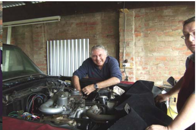
And the lads were happy with theirs