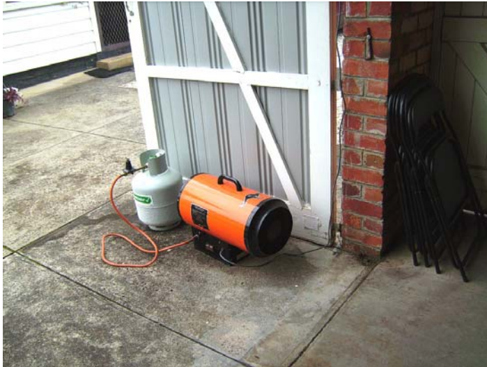
A bit of welcome heating

There's still a whole lot to do to Terry's 1968 Silver Shadow and it will be some time before she graces the road again but it keeps us all busy and we love every minute of it. It's worth noting here that Terry has no intention of making his Shadow a Concours winner but a car that he can enjoy and use. Just for good measure we gave that body a bit of a spruce up and it shone like a new pin. There's no rust and the car is always kept under cover so it will be quite a presentable example when the work is finally done.