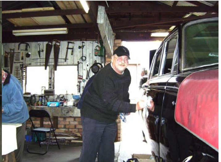
For a bit of fun I give the old girl a bit of a polish

Another day bit the dust and the car had a little bit more attention. I believe Terry is organising the fabrication of new lines for the hydraulics and a new wiring loom. Slowly but surely, things are taking shape.