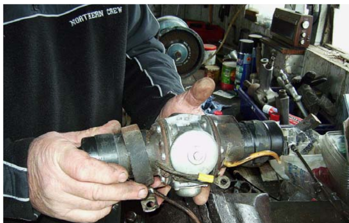
Mark completes the pump repair...