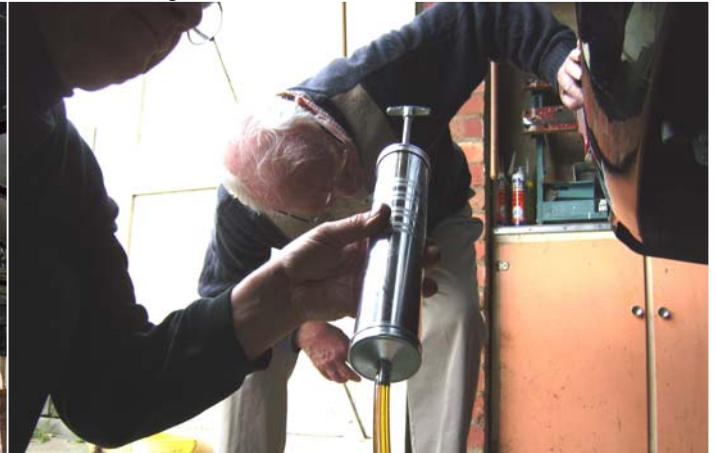
One of the best things since sliced bread Is an oil syringe