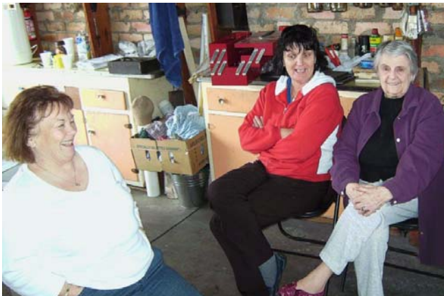
The ladies were quite happy with their own agenda

So here we are, back with Terry's Shadow and there are still lots of things to be done. Some of our Members turned up with their ladies (they probably wanted to see if we really did do any work) and while all attempts were made to get them involved in the action, the ladies were quite content with their own company; well, at least we were all happy.