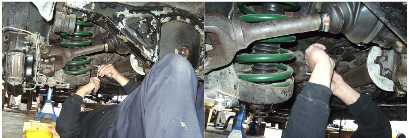
Terry prepares for the anti-sway bar

Steve started the process of installing the rear anti-sway bar but moved to installing the fuel pumps, so Terry finished the job. I got handed the mission of replacing all the globes for the dashboard lights and reconnecting the speedo cable to the dial before returning the whole lot to its proper place; I'm certainly pleased that all the wiring was labelled, otherwise the indicator might flash where the high-beam indicator should have been.