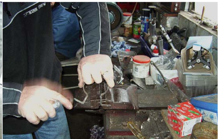
A bit of work was needed to repair the mounting bracket for the fuel pumps